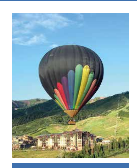
Register for Convention at archprecast.org/ 2024-convention

For more information on the APA Convention please visit the APA website at www.archprecast.org or contact the office at 850.205.5637.